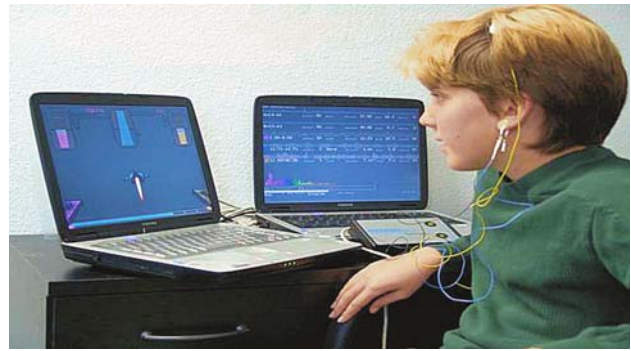
Fig. 1 Sample of neurofeedback set-up

As a child learns to control and improve brainwave patterns, the game scores increase and progress occurs. The only way to succeed at the games is for children to improve their brainwave function (following an operant conditioning paradigm). In research and clinical treatment